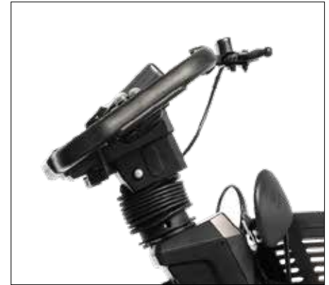
Supplemental Hand Brake